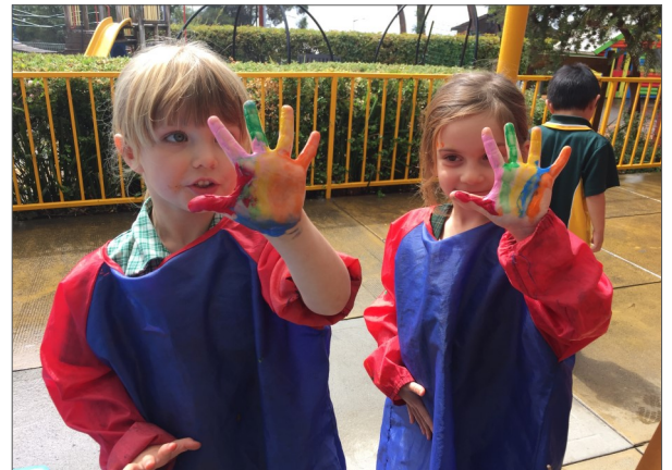
First day of school for Kinder Echidnas.