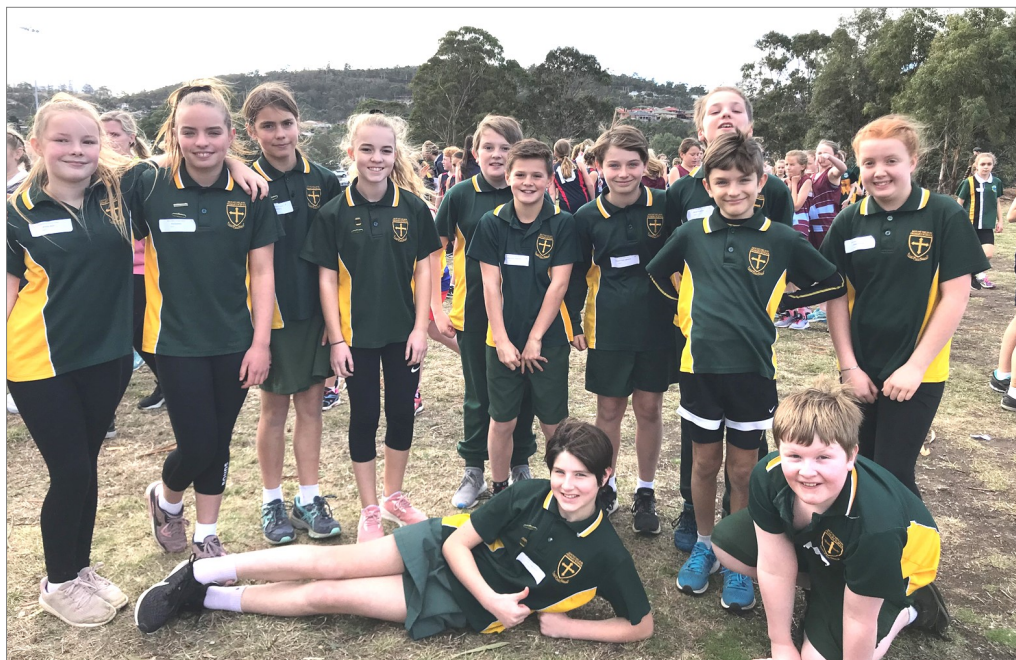
Our Mount Nelson Team at the Inter-Primary School Cross Country last week.